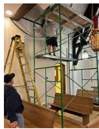
A special Thanks to DGK Scooter for coordinating the Church painting project.